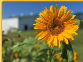
Gala Chair: Ashley Hoffbauer

$50 per person Be entered into an Early Bird Drawing if ticket is purchased before July 1st scan the QR Code